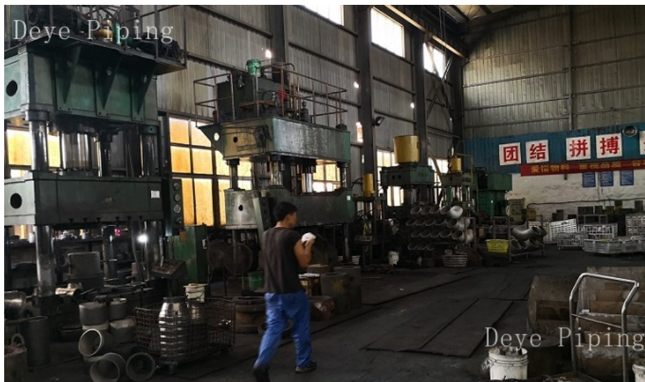
4. Material welding process (welded elbows )