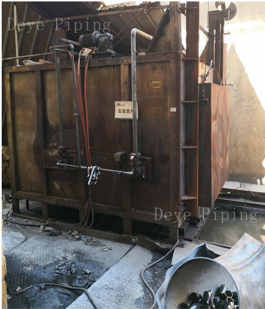
6. Shot Blast and cleaning