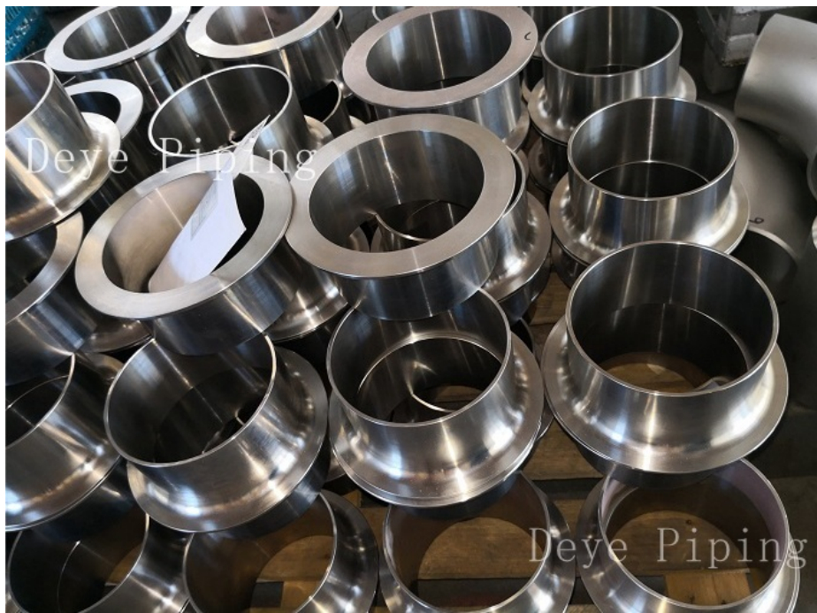
9. stainless steel Pipefittings Material In Stock